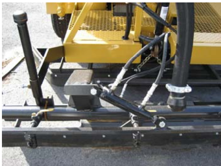
Fully Hydraulic Squeegee Controls Raise, Tilt, Swing