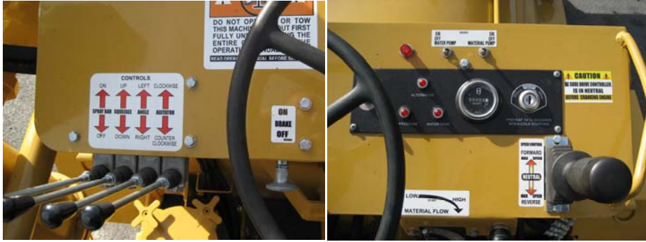
Easy Operator Controls