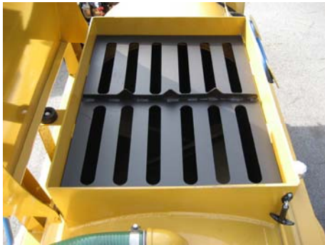
Large Material Loading w/bag ripper