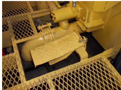
Foot controlled Material Discharge