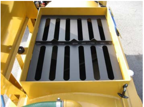
Large Material Loading w/bag ripper