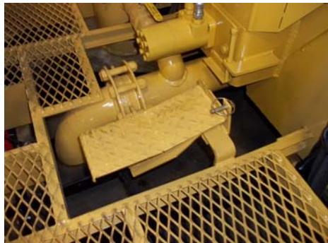
Foot controlled Material Discharge