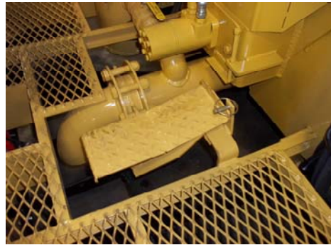
Foot controlled Material Discharge