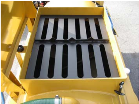
Large Material Loading w/bag ripper