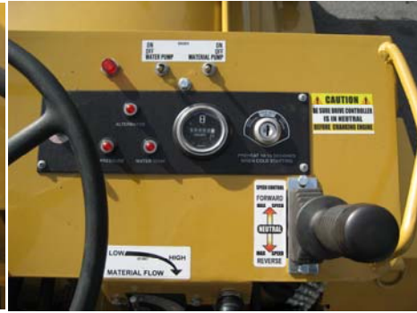
Easy Operator Controls